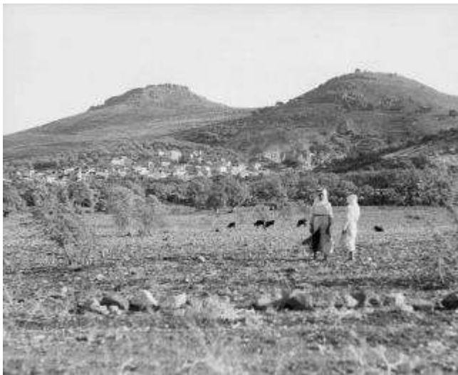
Karn Hattin, traditional location of the Sermon on the Mount

The translators have rendered this “a mountain,” viz. , no special mountain, just one near the place they were at. However, the Greek uses the definite article to opoj “the mountain,” seeming to signify a distinct mountain; viz. , one that was familiar to the disciples ( cf. Matt. 15:29-39). Tradition assigns this to Karn Hattin (the “Horns of Hattin”), the only height rising above the hills surrounding the shores of Lake Gennesaret, about five miles to the west. This mountain is named for the village now at its base and for the two horns that crown its summit, separated by a level place in between, which could have accommodated the multitudes that followed Christ. It also corresponds with Luke’s description of a level place or plain (τοπουπεδινου) where the Sermon on the Mount was delivered (Lk. 6:17).