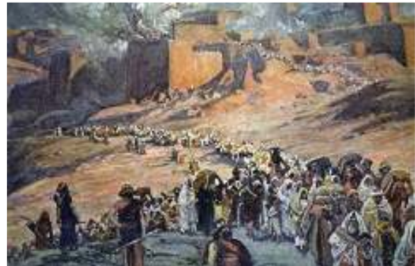
Nebuchadnezzar burns Jerusalem

Isaiah and Zephaniah describe the same time of judgment God was bringing upon the ancient world. The Assyrio-Babylonia invasions were like a great flood that rose up and spread across the world, sweeping away all before it (cf. Isa. 8:7, 8).