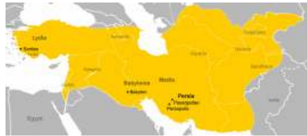
The Mede-Persian Empire was the largest the world had seen until that time

does not describe isolated incidents of wrath upon a single nation, but seems to be describe wrath world-wide in its sweep.